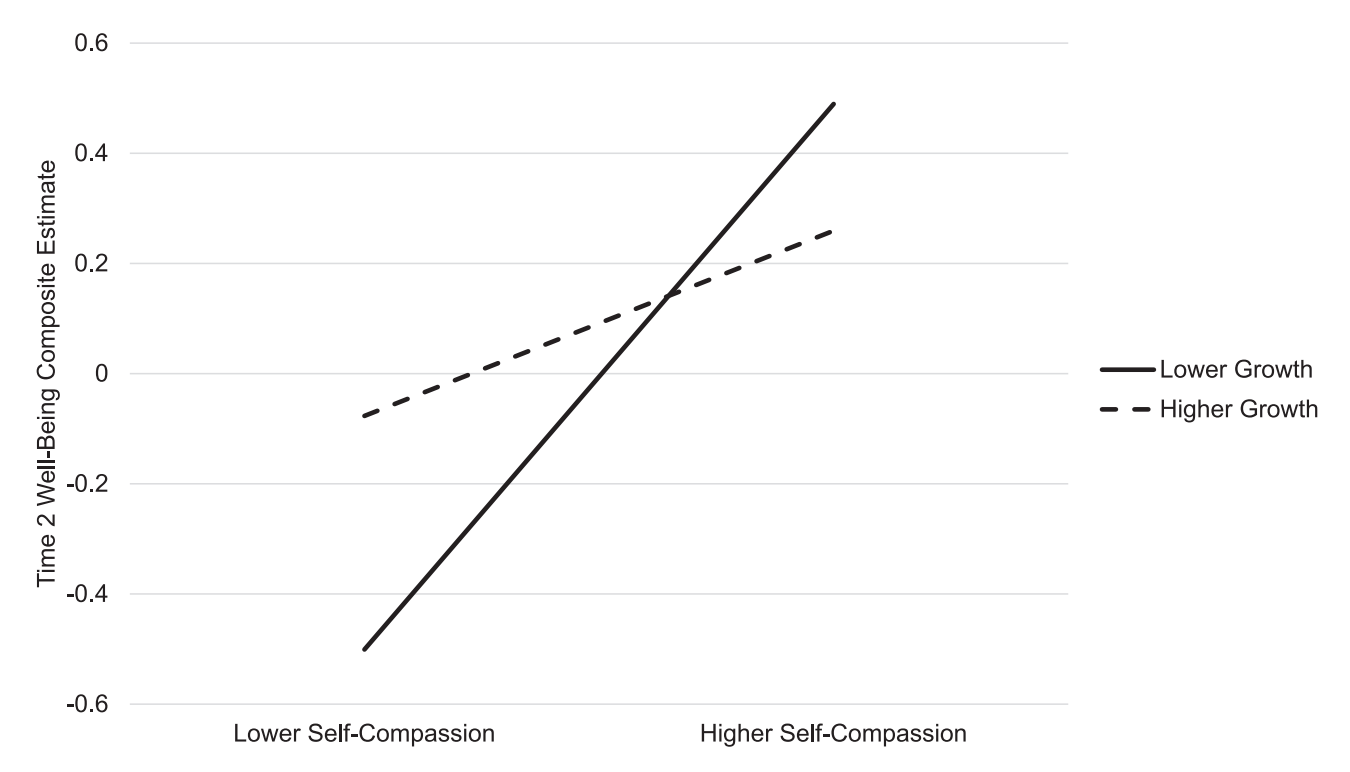
Fig. 2. Estimated Marginal Means of Time 2 Well-Being Scores given Time 1 Self-Compassion and Growth. Note. Scores for growth and self-compassion were set at -1 SD and +1 SD from the mean.

associated with each other, to be positively associated with measures of well-being and future orientation, to explain unique variance in these measures when considered simultaneously, and to show an amplified interaction for these measures. We found some support for expectations, as well as areas of nuance or surprise that we address below.